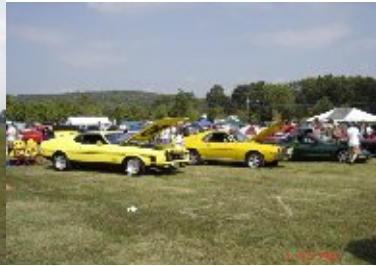
Billy Hammonds 71 Mach 1 next to a 69 AMX