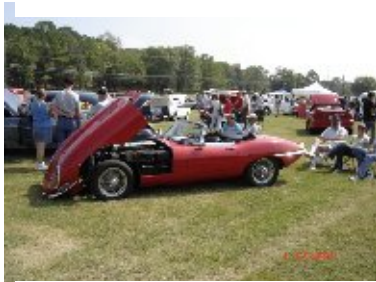
69 XKE Jag, beautiful!