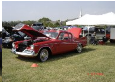
My vote for Best of Show, 56 Studebaker Silver Hawk