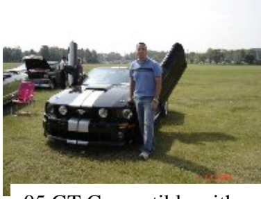
05 GT Convertible with Lamborghini doors & light bar