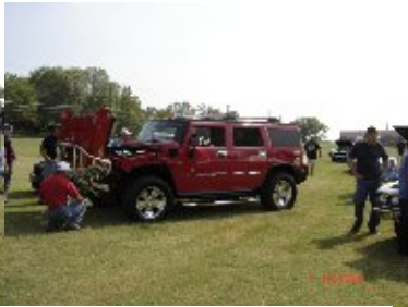
05 Hummer H2 with a Supercharger!!! 500+ HP