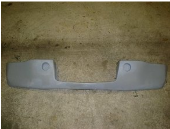
65 – 66 Fiberglass Shelby style front valance. $100

1965 Mustang hood (small dent in center). $150