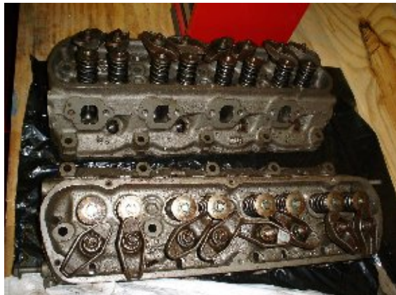
Set of 289 heads (large valves) ready to bolt on. $500