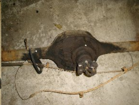
Ford 8" rear end (5 lug). $100