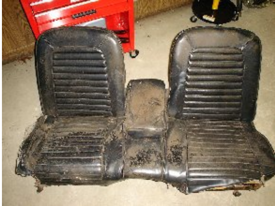
65 – 66 Mustang front bench seat. $200