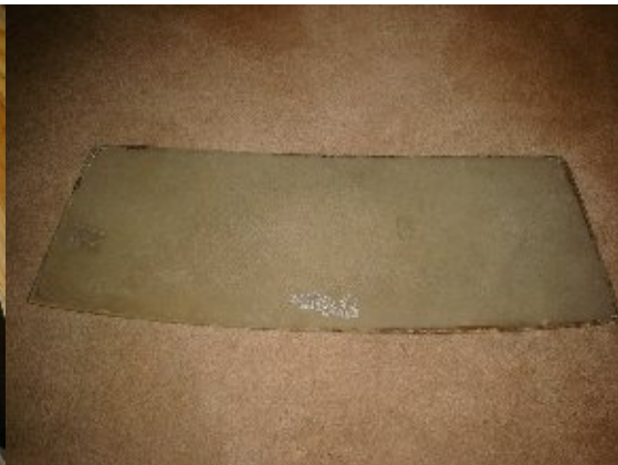
1965-1966 Coupe back glass. $250