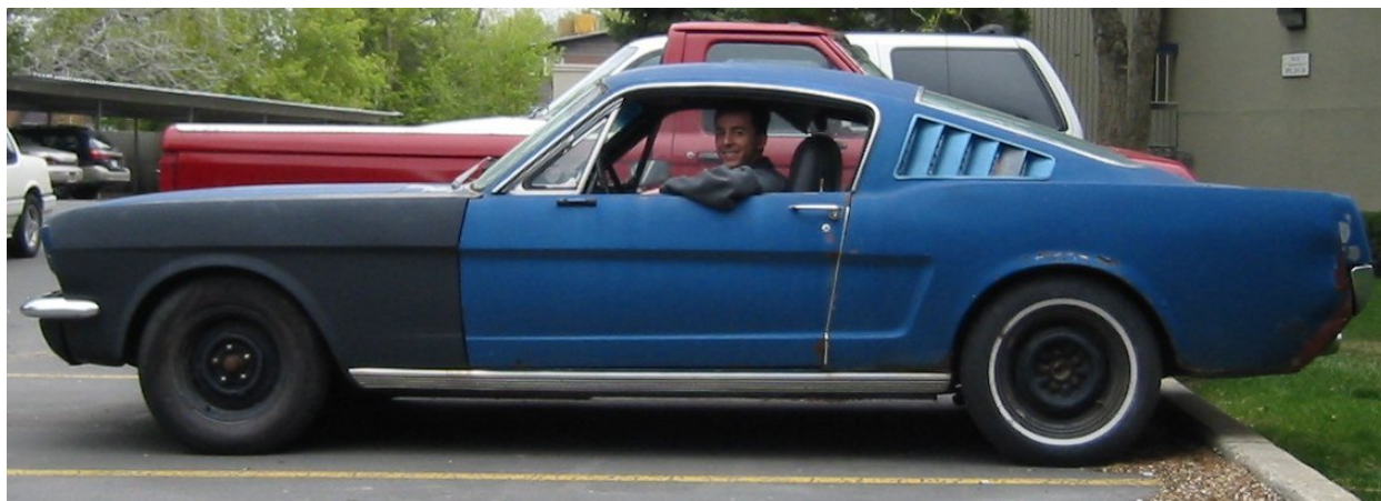
1966 Mustang 2+2