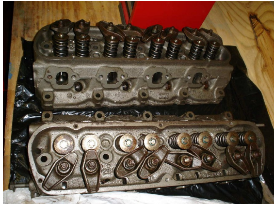
Set of 289 heads (large valves) ready to bolt on. $500