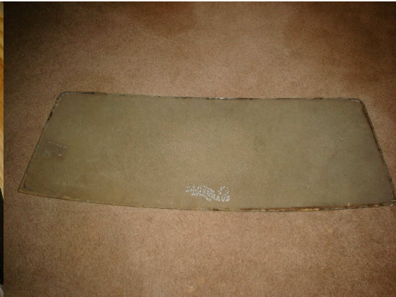
1965-1966 Coupe back glass. $250