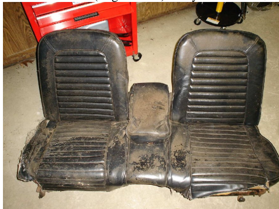
65 - 66 Mustang front bench seat. $200