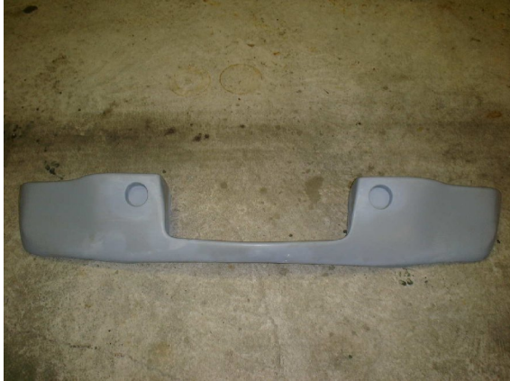
65 – 66 Fiberglass Shelby style front valance. $100

1965 Mustang hood (small dent in center). $150