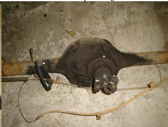
Ford 8" rear end (5 lug). $100