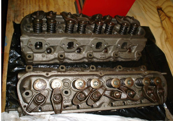
Set of 289 heads (large valves) ready to bolt on. $500