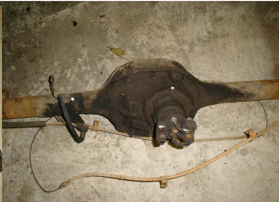
Ford 8" rear end (5 lug). $100