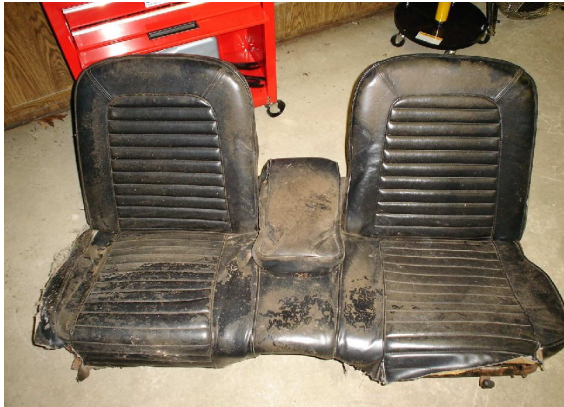
65 - 66 Mustang front bench seat. $200