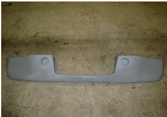
1965 Mustang hood (small dent in center). $150