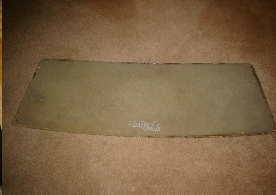
1965-1966 Coupe back glass. $250