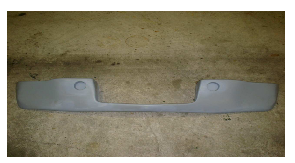
65 – 66 Fiberglass Shelby style front valance. $100

1965 Mustang hood (small dent in center). $150 Stock 289 heads. $100 Front and rear (coupe) window chrome. $75 C4 Transmission (may need rebuild). $75 Stock 289 cast manifolds. $50 1965 front bumper. $50 289 Crankshaft (ground 0.010" undersized). $50 Contact Chad Whisnant (256) 566-6298 cawhiz@charter.net for all these 1965-1966 parts.