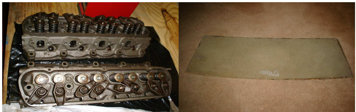
Set of 289 heads (large valves) ready to bolt on. $500

For Sale: New 16" Bright machined-aluminum wheels with chrome spinners including mounted BF Goodrich Traction T/A P215/65R16 tires removed from new Mustang. Used less than 50 miles. $600 Contact Larry Burke at (256) 503-5145 or LBurke9701@aol.com