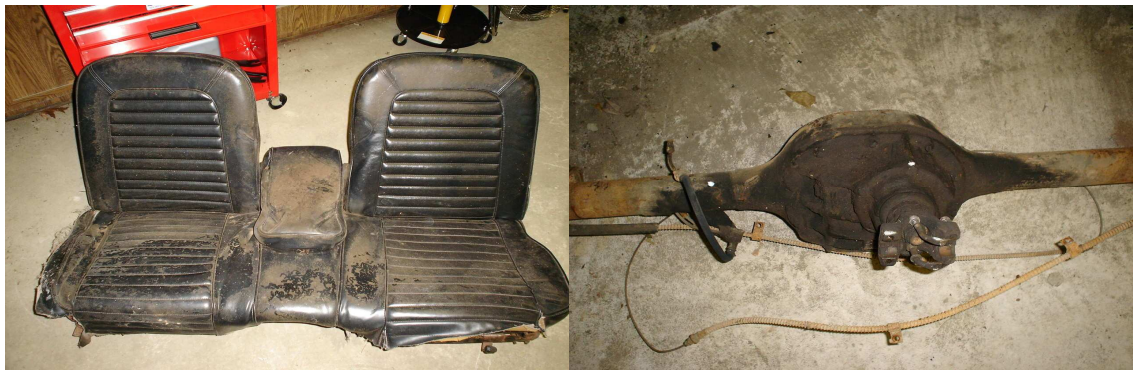
65 – 66 Mustang front bench seat. $200