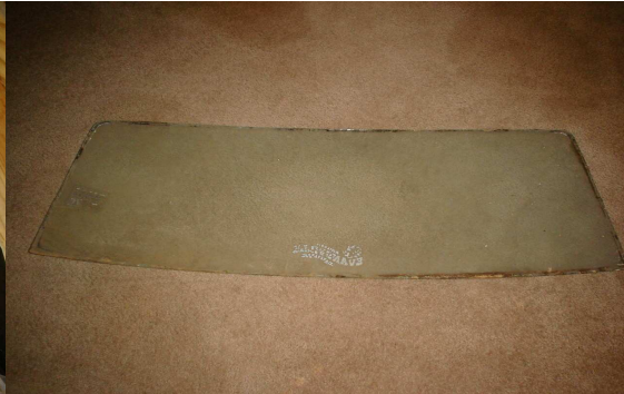
1965-1966 Coupe back glass. $250