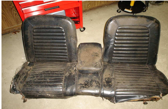
65 - 66 Mustang front bench seat. $200