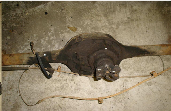
Ford 8'' rear end (5 lug). $100