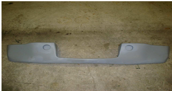
1965 Mustang hood (small dent in center). $150