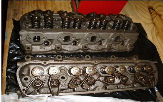
Set of 289 heads (large valves) ready to bolt on. $500