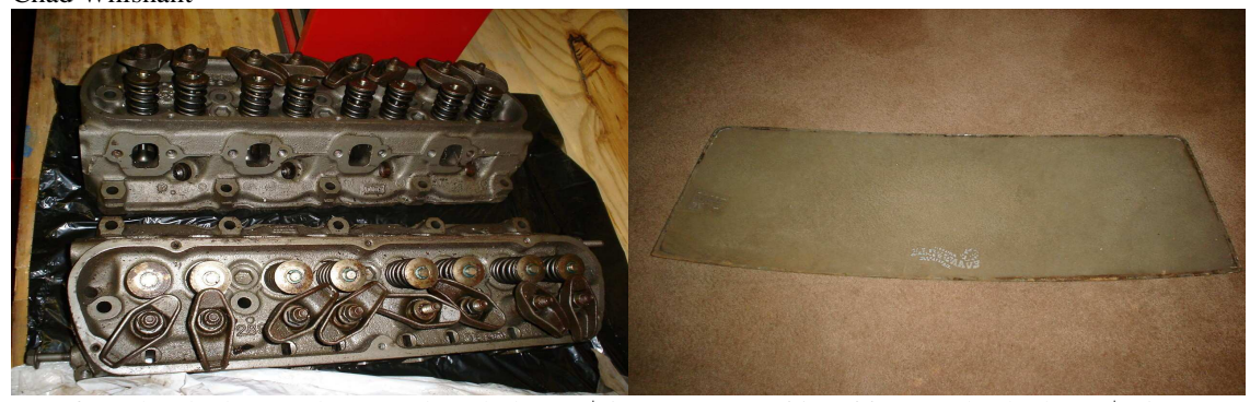
Set of 289 heads (large valves) ready to bolt on. $500