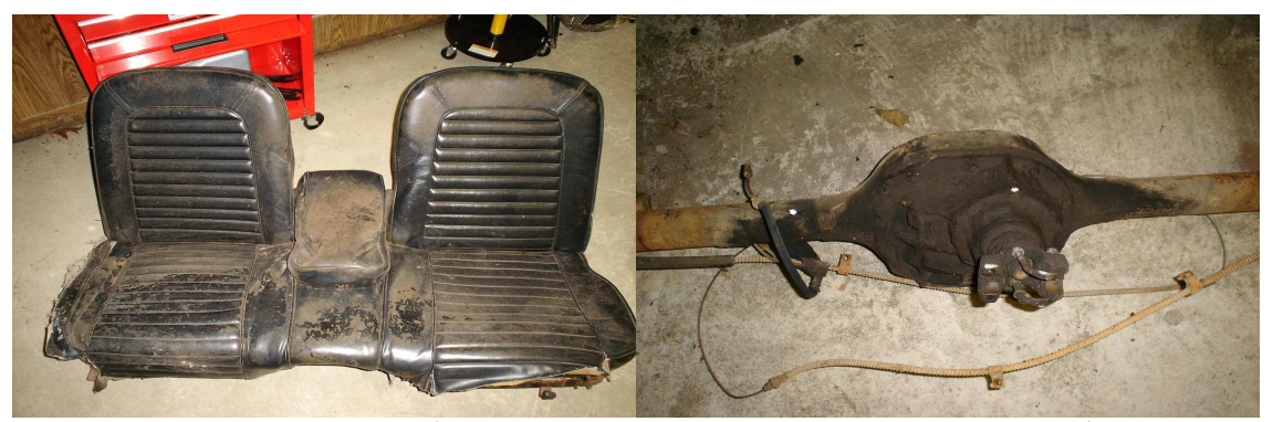
65 – 66 Mustang front bench seat. $200