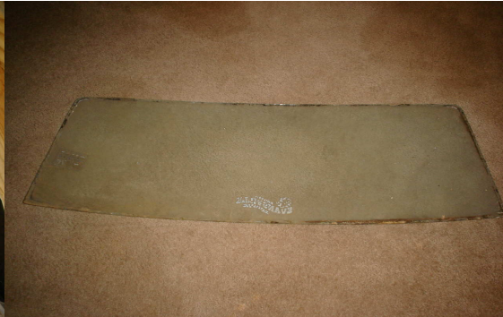
1965-1966 Coupe back glass. $250