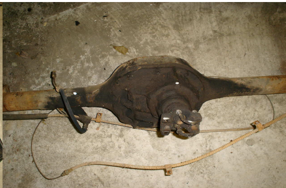
Ford 8" rear end (5 lug). $100