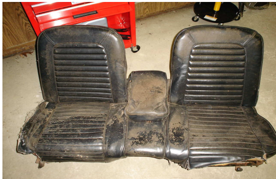
65 - 66 Mustang front bench seat. $200