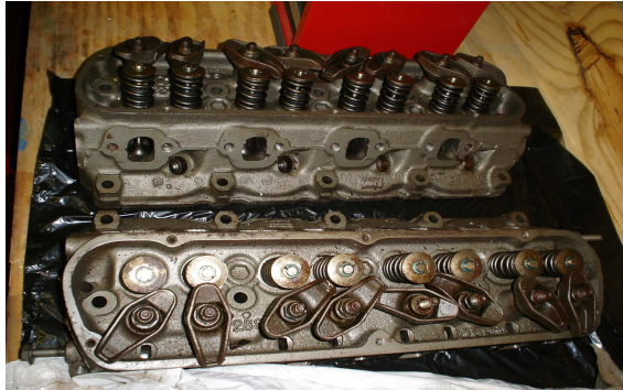
Set of 289 heads (large valves) ready to bolt on. $500