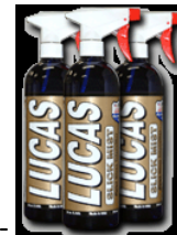
Vic van Leeuwen -