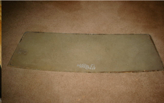
1965-1966 Coupe back glass. $250