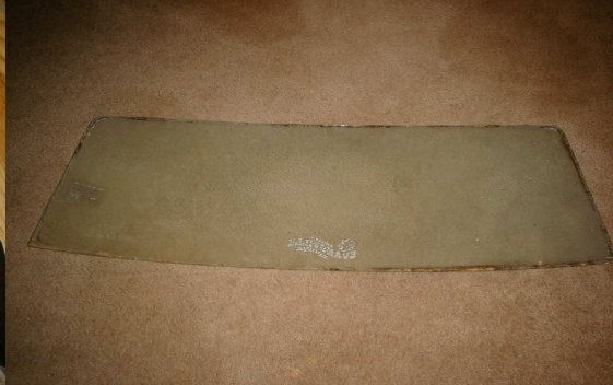
1965-1966 Coupe back glass. $250