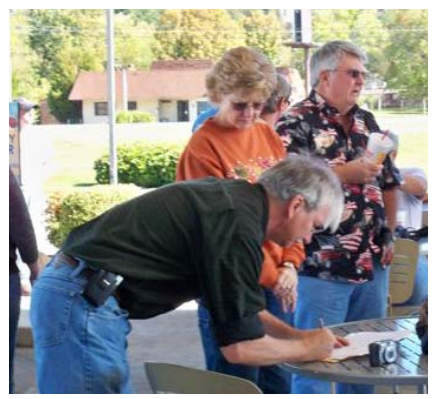
"I promise not to break any traffic laws...within reason; and will donate any parts that fall off my car to...."