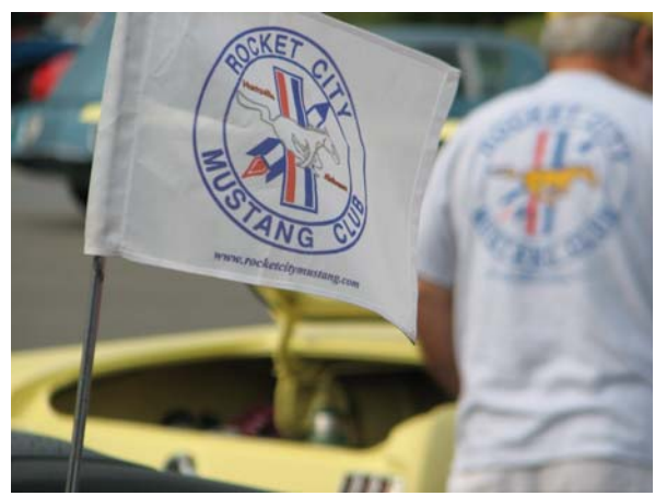
- See next page for RCMC's great sponsors! -