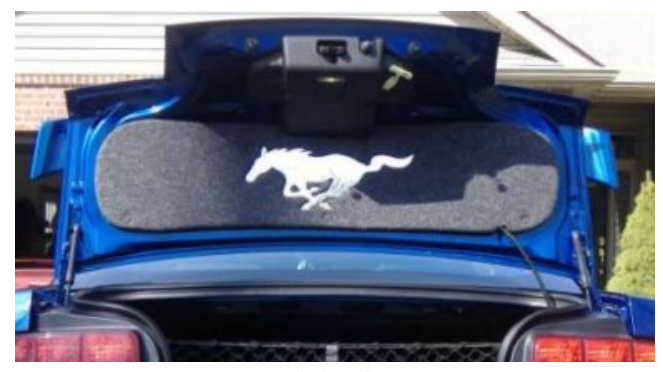
www.grand design mat.com