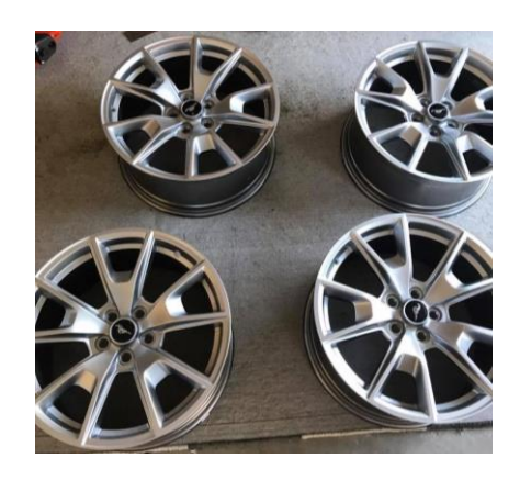
Chris Dailey has a set of 2015\,50^{th} Anniversary wheels (only) for sale. Wheel size 19'' \times 8.5'' . $500.00 for the set.